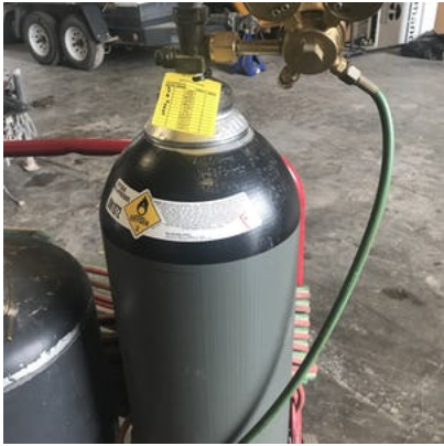
Compressed gas cylinders properly marked and tagged.