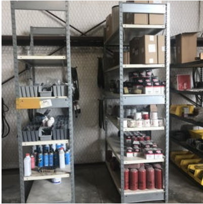
Materials stored properly.

Material Storage & Handling: Comments / Notes None