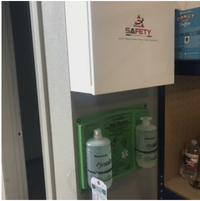
Eyewash bottle station tagged.