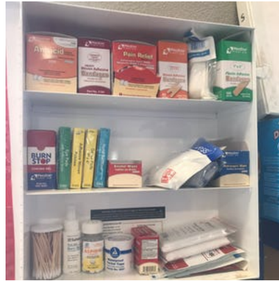
First aid kit fully stocked.