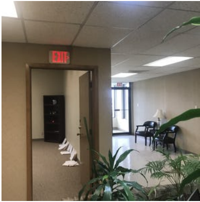
Office has both illuminated indicator and non-illuminated guidance egress path.