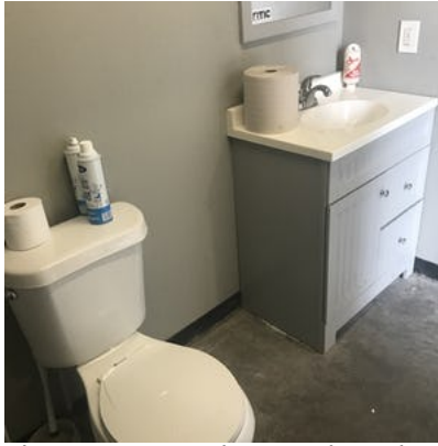
Shop restroom clean and stocked.