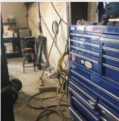
Unused hoses and cords not strung and stored.

Walking & Working Surfaces: Comments / Notes Shop doesn't have a storage rack, or mezzanine.