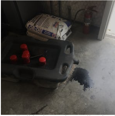
Small oil leak was immediately cleaned up.

Shop floor was fairly clean, small amounts of waste were placed in trash.