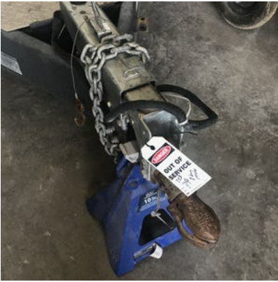
Generator being repaired with proper lockout / tagout device installed.