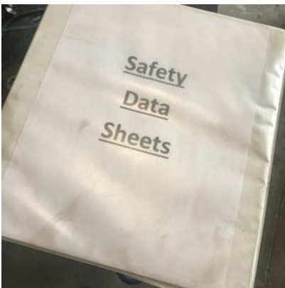
SDS book available and properly marked.