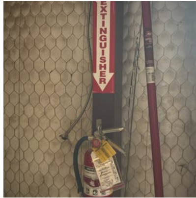
Office extinguishers tagged and inspected. Shop extinguishers tagged and inspected.