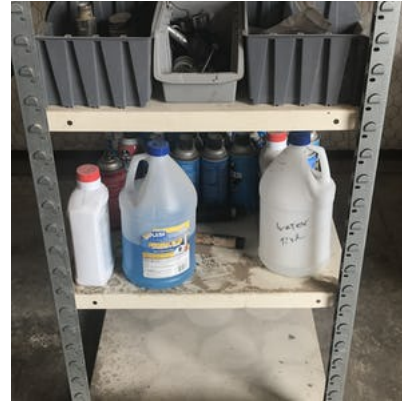
All liquids marked.