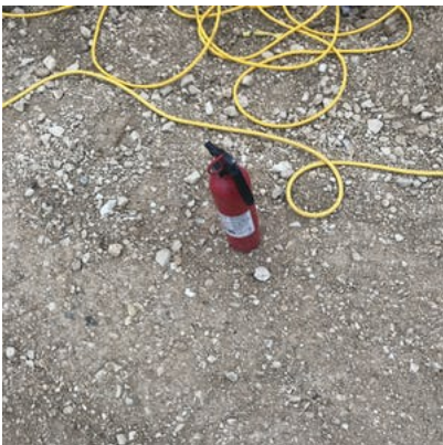
At least a 10lb Type ABC extinguisher should be readily available were any fire hazards may exist. Extinguisher needs an annual inspection.