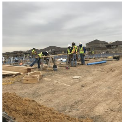
Crew put together two horses to use for cutting, eliminating the practice of using their bodies for stabilizing pieces.