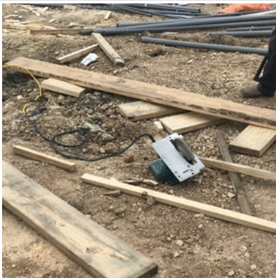
Employees were using their feet and legs to stabilize boards they were about to cut.

4) Observation 4 - An employee was using a skid steer and when I asked about his operator card, he said he was never issued one. This is training I can conduct for them, which I will discuss with the company.