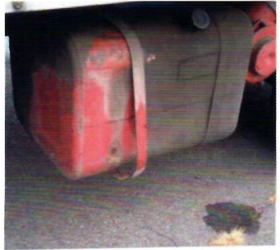
a. (2) Fuel Tank Not Properly Secured