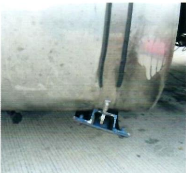
a. (2) Fuel Tank Not Properly Secured