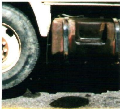
a. (1) Fuel System Leak