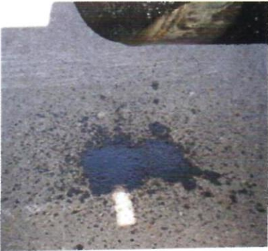
a. (1) Fuel System Leak