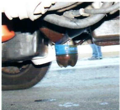
a. (1) Fuel System Leak