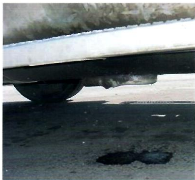
a. (1) Fuel System Leak