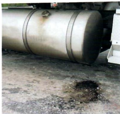
a. (1) Fuel System Leak