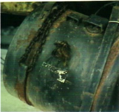
a. (2) Fuel Tank Not Properly Secured