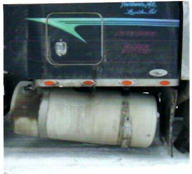
a. (2) Fuel Tank Not Properly Secured