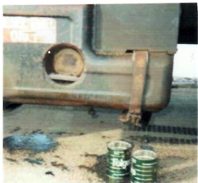
a. (1) Fuel System Leak