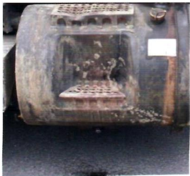
a. (1) Fuel System Leak