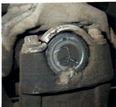
b. (3) Broken Universal Joint Bearing Strap