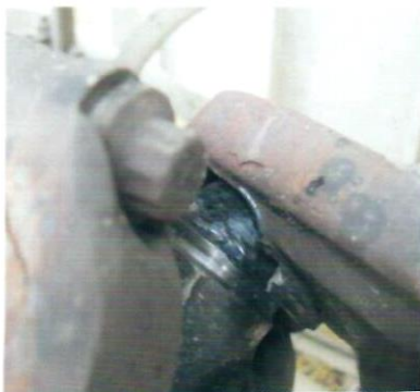
b. (1) Defective Universal Joint