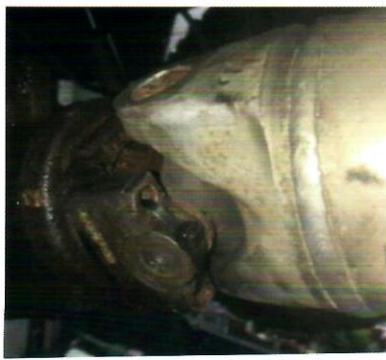
b. (3) Missing Bearing Strap