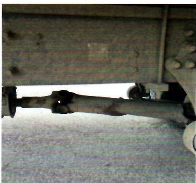
d. (3) Twisted Driveshaft Tube