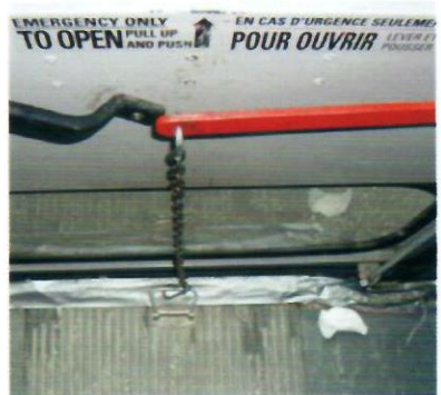
a. School Bus Emergency Exit Chained Shut