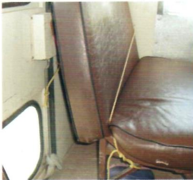
a. School Bus Emergency Exit Tied Shut