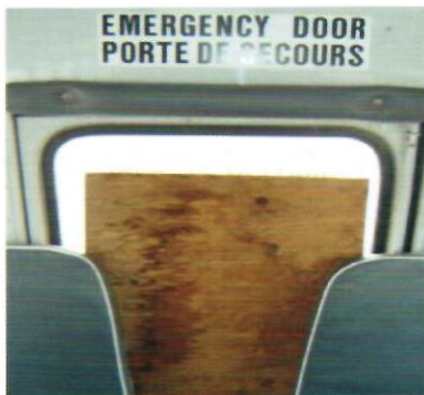
a. School Bus Emergency Exit Obstructed