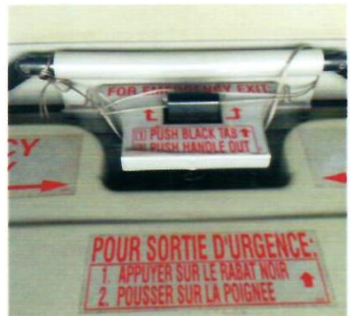
a. Roof Hatch Tied Shut