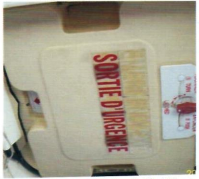
a. School Bus Roof Hatch Tied Shut