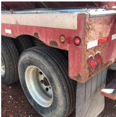
ABS lamp inoperable when brakes applied.