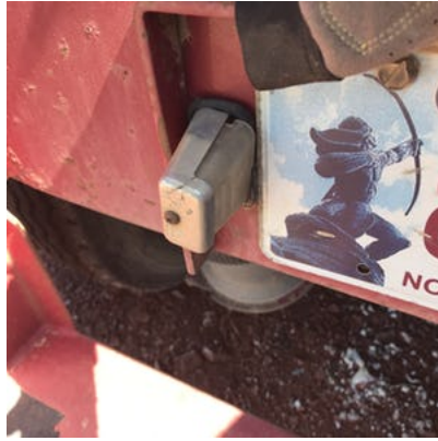
Plate lamp inoperable