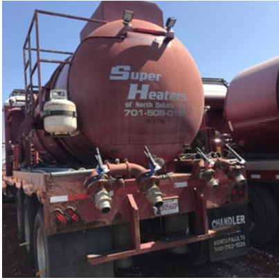
Upper reflective sheeting missing