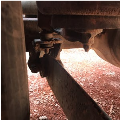
Axle 2 left shock loose (missing bushing)