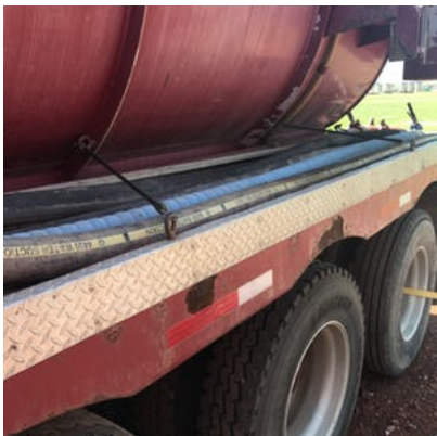
Bungee cords used to strap down hoses.