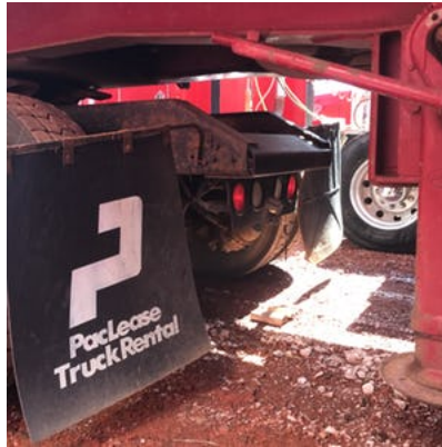
Mud flaps missing red/white reflective sheeting.