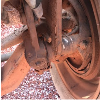
Steering axle slack adjusters loose, have excess left to right movement. Possible blown seals.