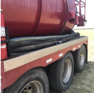
Hoses not adequately strapped down. Bungee cord has no load limit capacity.