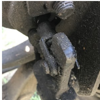
Axle 1 left slack adjuster covered in oil.