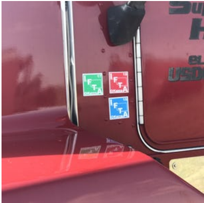
Multiple IFTA stickers, removed expired ones.