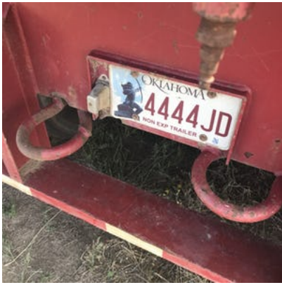
License plate out on trailer.