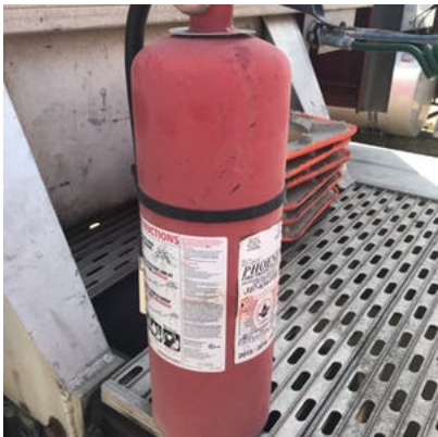
Fire extinguisher has expired annual service inspection.