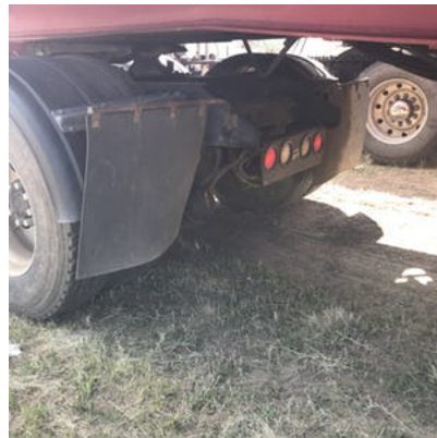
Both mud flap missing red/white reflective sheeting.