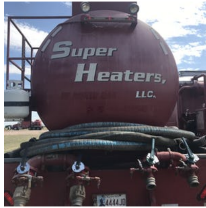
Rear tank reflective sheeting torn / insufficient.