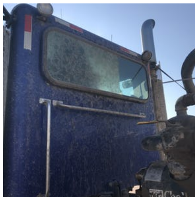
Wrong color reflective sheeting on back of cab.