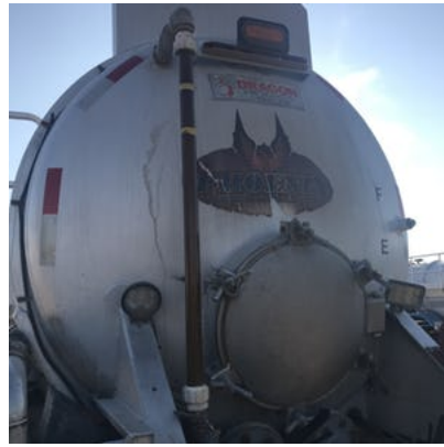
Wrong color reflective sheeting upper rear area of trailer.