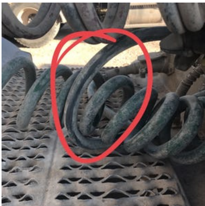
Electric line chafing on catwalk. Has worn grommet.