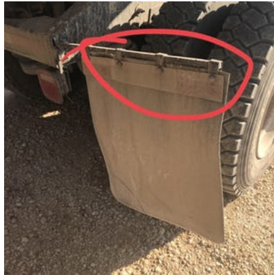
Rear right mud flap dirty - reflective sheeting covered in dirt / mud ineffective appearance.