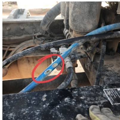
Hose chafing - Air ride suspension (two separate flat spots on service side)