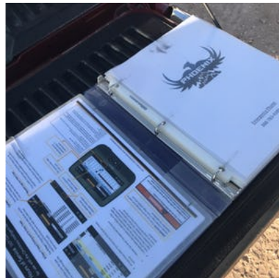
PLS Big Spring has very presentable permit books.