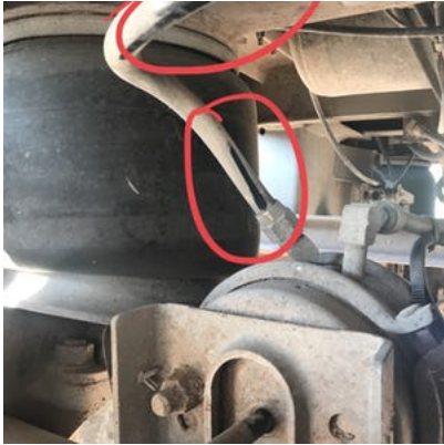
Axle 4 Right - Brake hose chafing (no splitter)