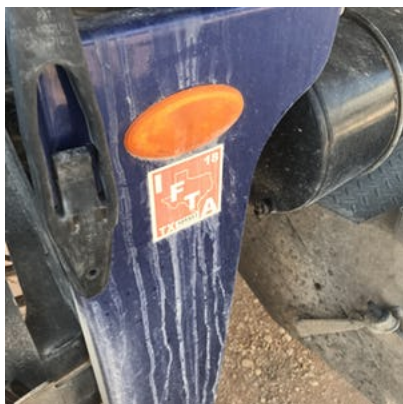
Removed both expired 2018 IFTA decals.