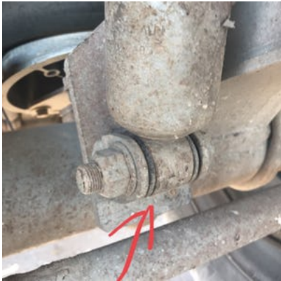
Axle 4 Left - Shock loose (bushing worn)