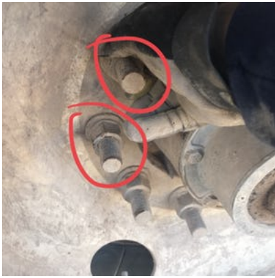
Axle 4 Left (front trailer axle) - Two loose wheel fasteners side by side OOS**