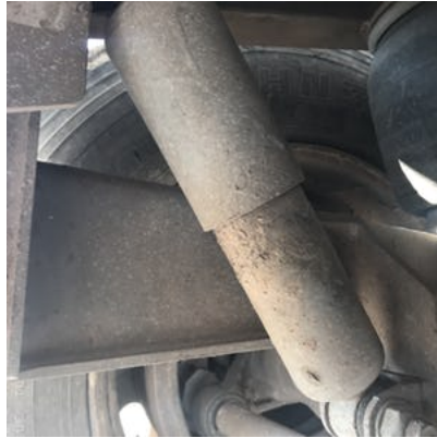
Axle 4 Right - Shock loose